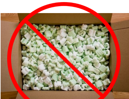
NO PACKING PEANUTS