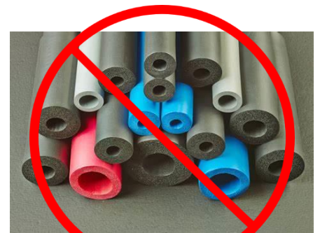
NO PIPE INSULATION