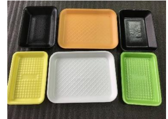
CLEAN MEAT & PRODUCE TRAYS