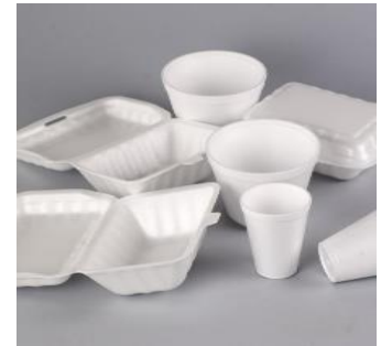
CLEAN #6 PLATES & CUPS