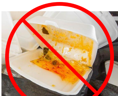
NO DIRTY FOAM PRODUCTS