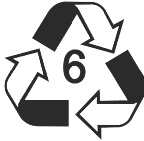
MUST HAVE #6 SYMBOL