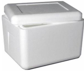
#6 FOAM COOLERS